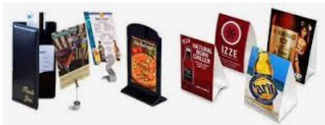
Table tents are perfect for marketing anywhere people gather: restaurants, lobbies, front counters, service desks, conference tables, trade show booths. Use them to announce new products, promote upcoming events, and build general brand awareness in the community. Have some

extra display space in your office or lobby? Put table tents to work for you!